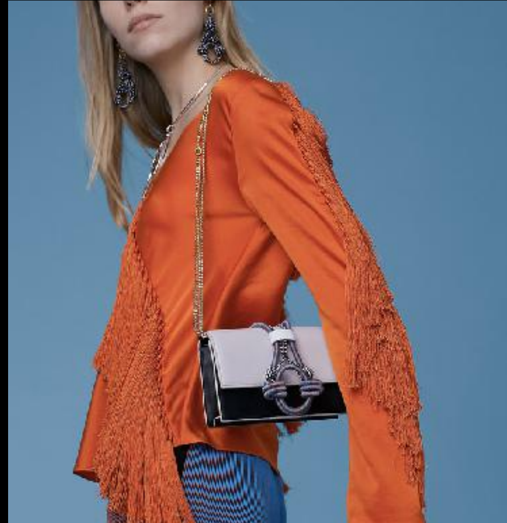
DVF X SEQUENCE