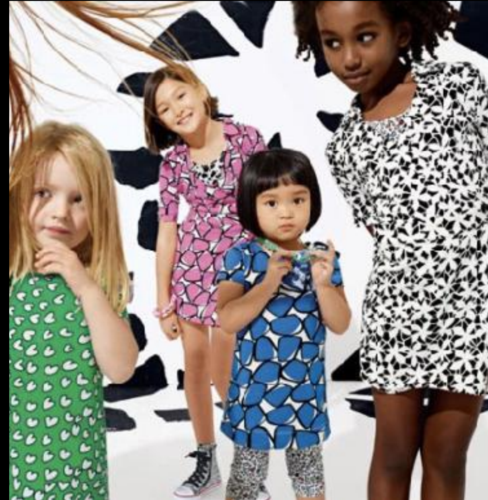
DVF X GAP KIDS