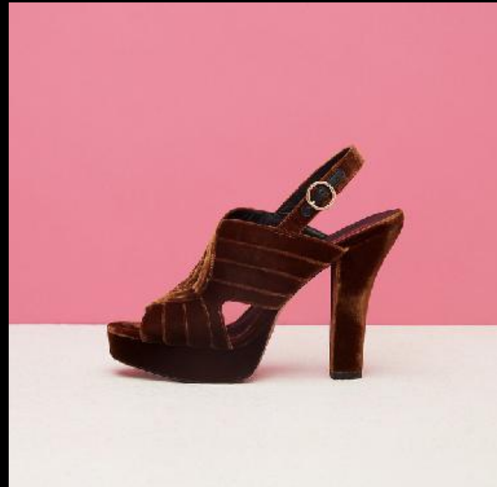
SHOES + ACCESSORIES