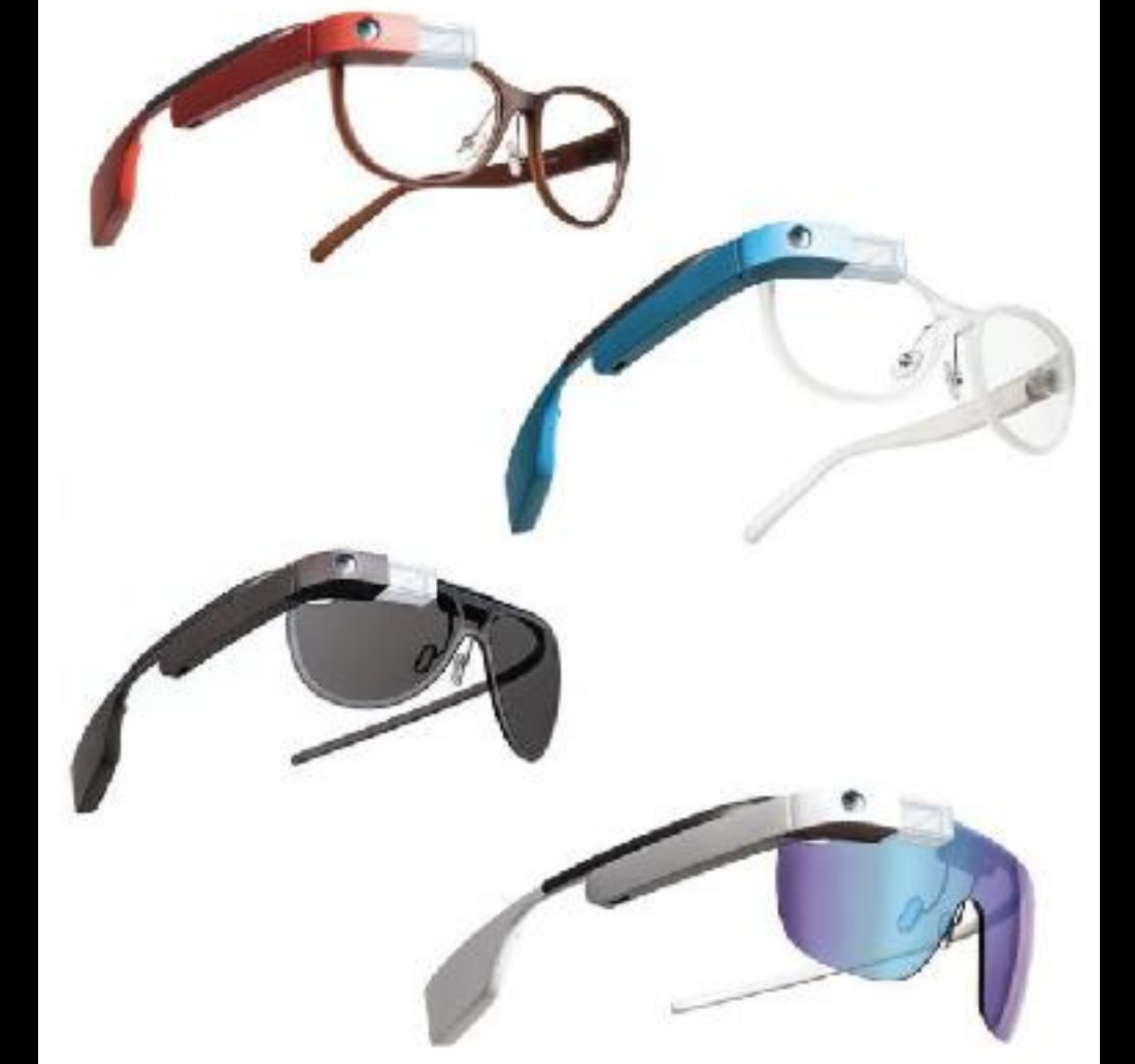
DVF X GOOGLE GLASS