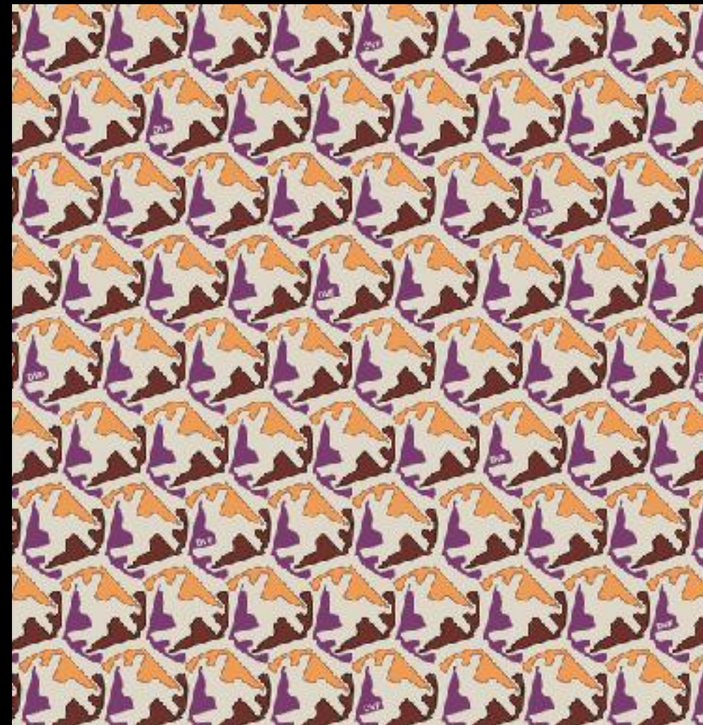
DVF X ETIHAD AIRWAYS