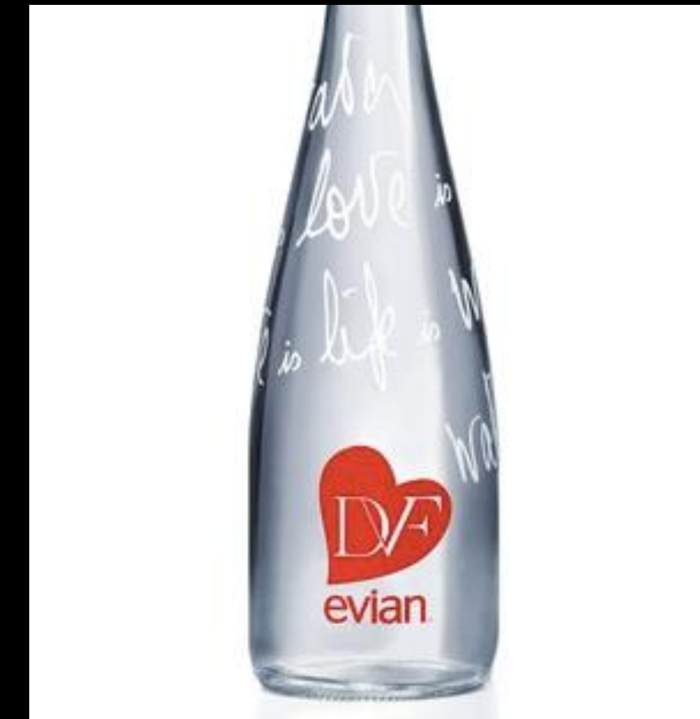
DVF X EVIAN