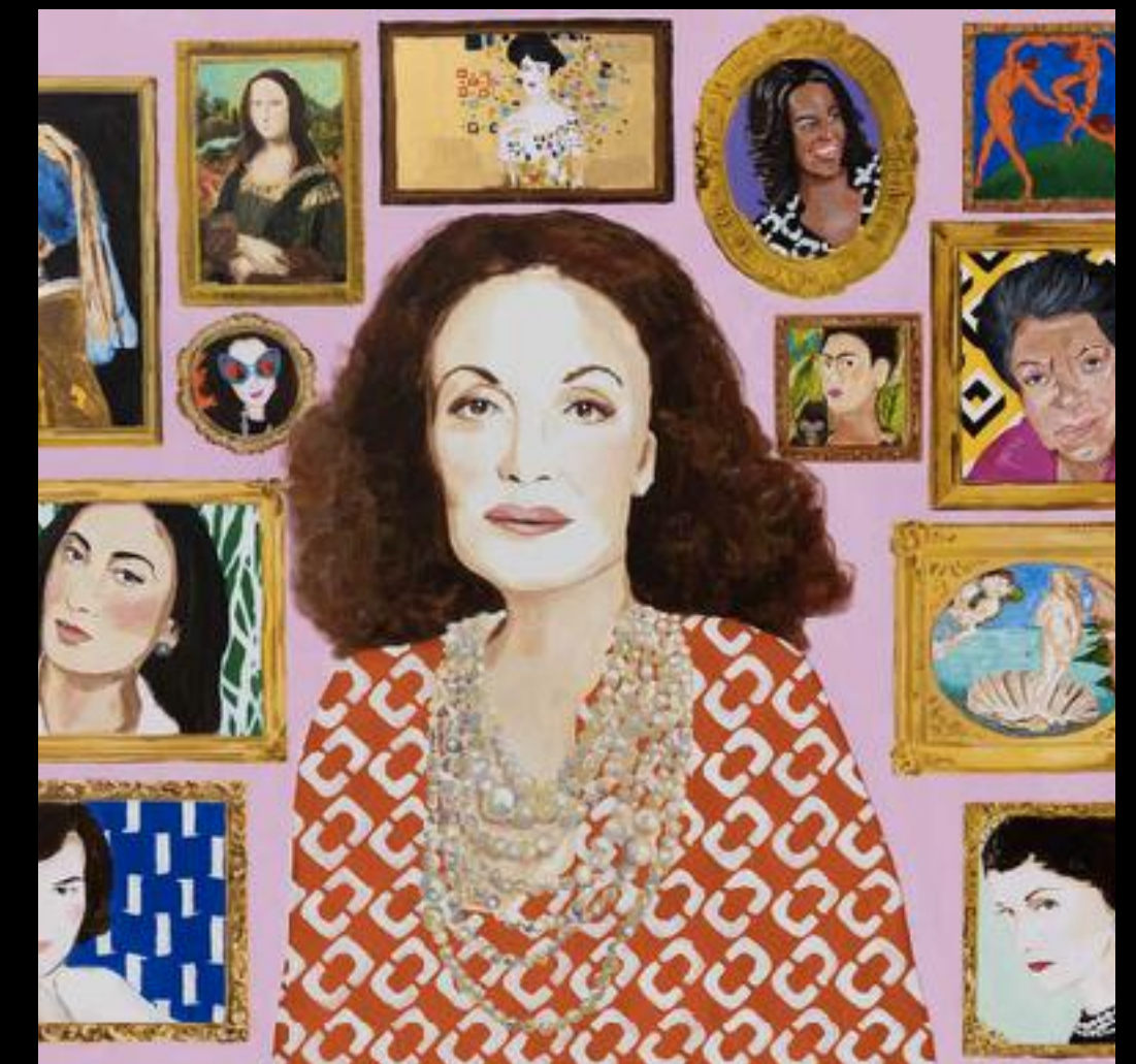
DVF X ASHLEY LONGSHORE